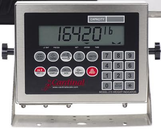
CWL-40 with rubber ramps shown here with optional 215 indicator and P150 battery-operated tape printer.